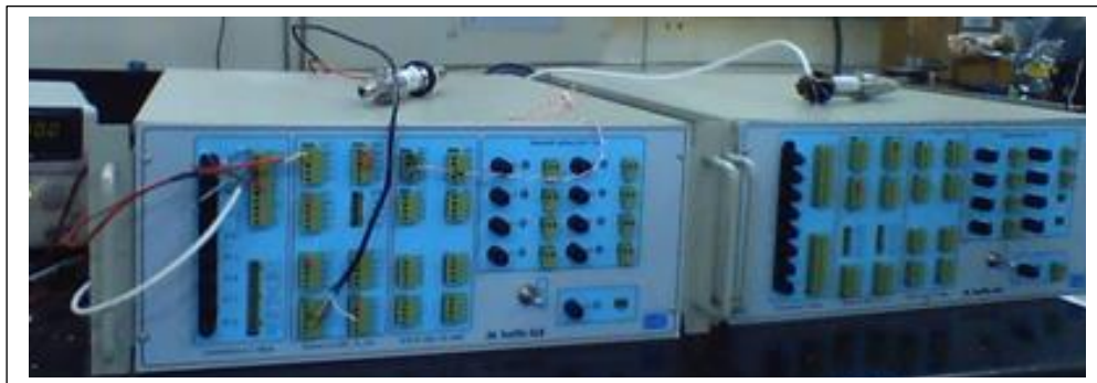
Datalogger DL Traffic 018 units designed and manufactured by FCRI.

FCRI delivered three numbers of custom designed Data-loggers to MPSPD Division of Liquid Propulsion Systems Centre, Bangalore. The units operated through Windows based GUI on Laptop/PC have 32 Inputs and 9 Outputs and are capable of acquiring data at user selectable rate from 1 Samples per second to more than 2000 Samples per second.