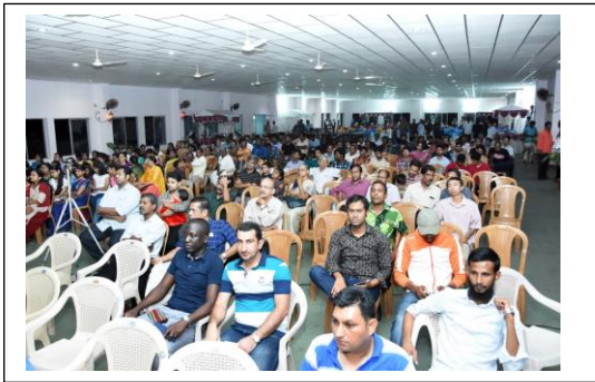
Family members, International Trainees at the Foundation Day