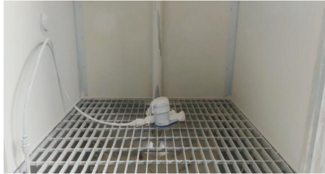
IP 5X tests on a DUT

Ingress Protection Test as per IP X8 was conducted on a second sample as per IEC 60529 Ed-2.2 2013-08 (section 14.2.8), with meter immersed in water to a depth of 1.5m for a period of 4 hrs.