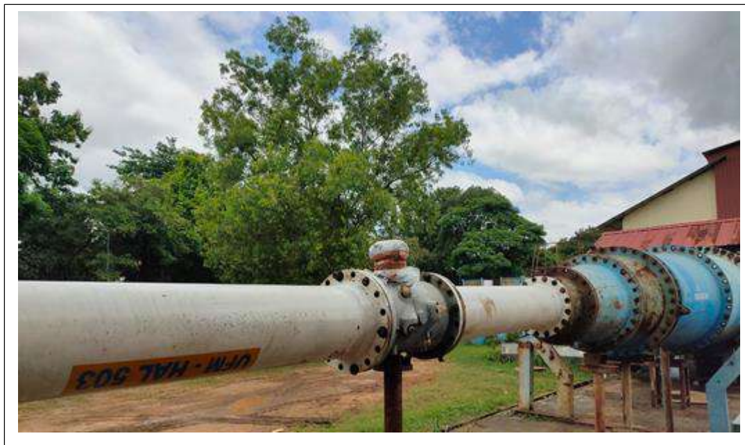
Calibration of 400 mm ultrasonic flow meter

Calibration of 400 mm ultrasonic flow meter was done at Large Water Flow Laboratory