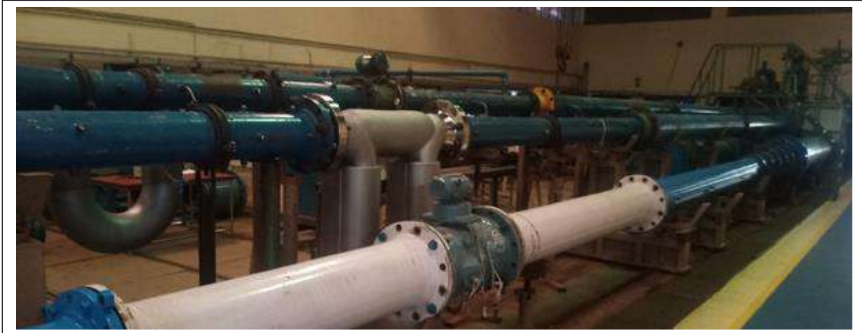
Calibration of inline ultrasonic flowmeter

Calibration of inline ultrasonic flowmeter was done at Water Flow Laboratory