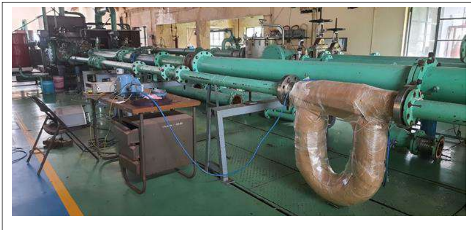
Mass flow meter of size 4" calibration at Oil Flow Laboratory

Mass flow meter of size 4" was calibrated at Oil Flow Laboratory