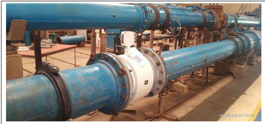
Calibration of 500mm magnetic flow meter at WFL

Calibration of 500mm magnetic flow meter was carried out at Water Flow Laboratory