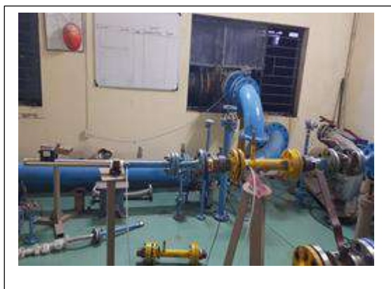
Calibration of flow products at HPATF