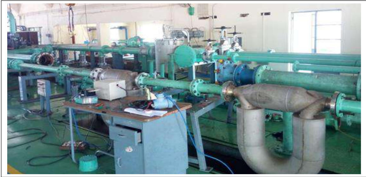
Calibration of mass flow meter (Size 3") at OFL

Calibration of mass flow meter (Size 3") was done at Oil Flow Laboratory.