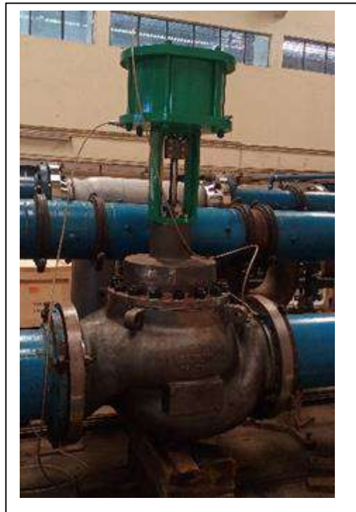
18" valve under test at WFL

Testing of 18" valve was conducted at Water Flow Laboratory