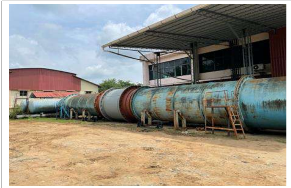
Calibration of 3000mm EMF at LWFL

Calibration of 3000 mm Electromagnetic flow meters was performed at Large Water Flow Laboratory. A total of 11 meters were completed so far.