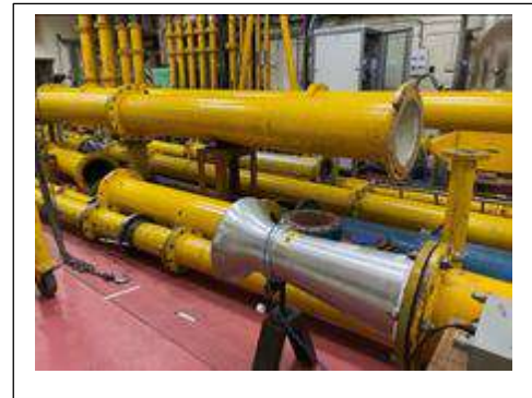
Calibration of flow meters at Air Flow Laboratory