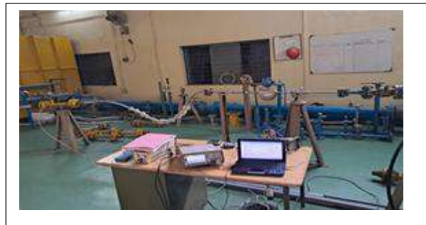
Calibration of Mass Flow Meters at HPATF