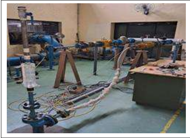
Calibration of Rota meter at HPATF

Calibration of Rota meter was carried out at HPATF