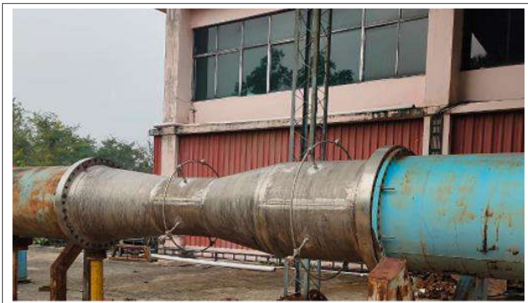
Venturi type flowmeters of size 42 inches calibration at LWFL

Venturi type flowmeters of size 42 inches was calibrated at the Large Water flow Lab