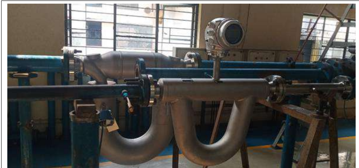
Calibration of 4" mass flowmeter at WFL

Calibration of 4" mass flowmeter was carried out at Water Flow Laboratory