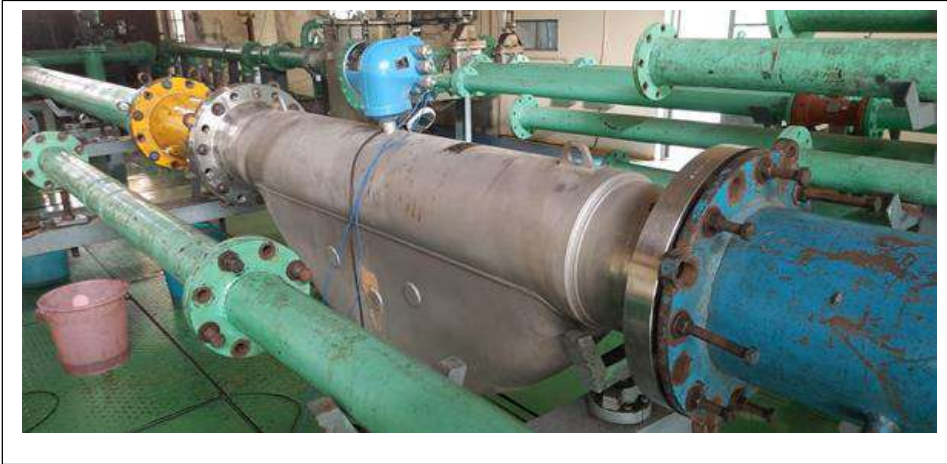
Calibration of mass flow meter of size 8" at OFL

Calibration of mass flow meter of size 8" was carried out at Oil Flow Laboratory