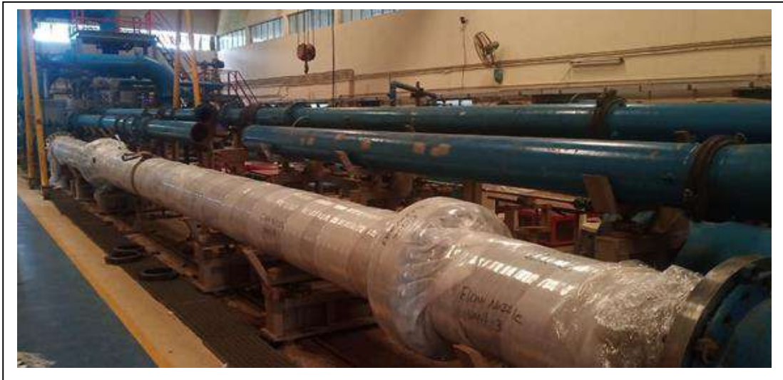
Calibration of throat tap Flow Nozzle at WFL

Calibration of throat tap Flow Nozzle was performed at Water Flow Laboratory