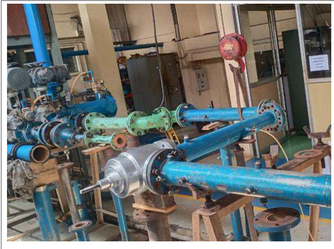
Testing of 4" angle valve at WFL

Testing of 4" angle valve with different trim modifications was performed at Water Flow Laboratory. The testing was done for 24 openings.