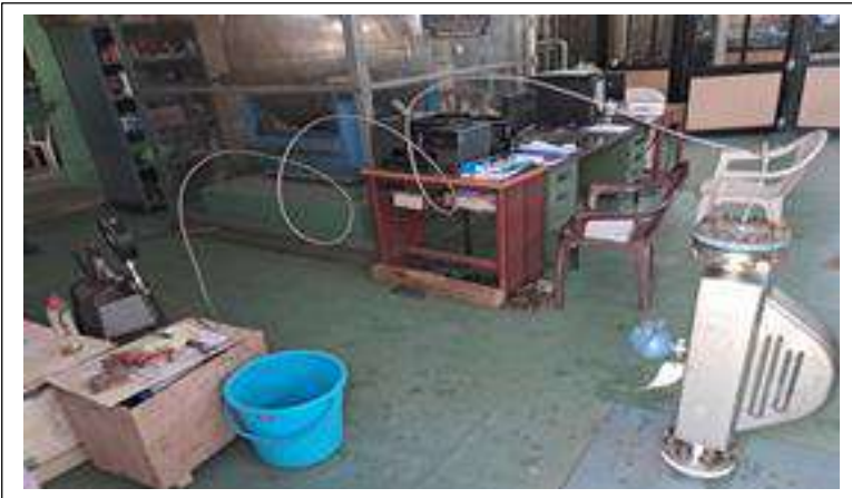
Hydro testing of Mass Flow Meter at HPATF

Hydro testing of Mass Flow Meter was carried out at HPATF