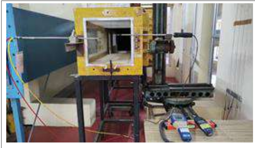
Calibration of Digital Anemometer at Wind Tunnel

Calibration of Digital Anemometer was carried out at Wind Tunnel