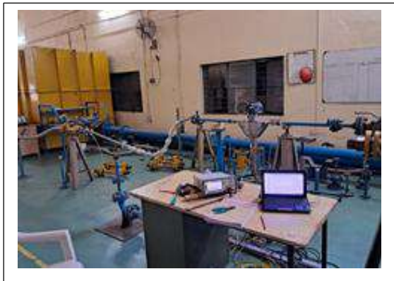
Calibration of 1/2" Mass Flow Meter at HPATF

Calibration of 1/2" Mass Flow Meter was carried out at HPATF