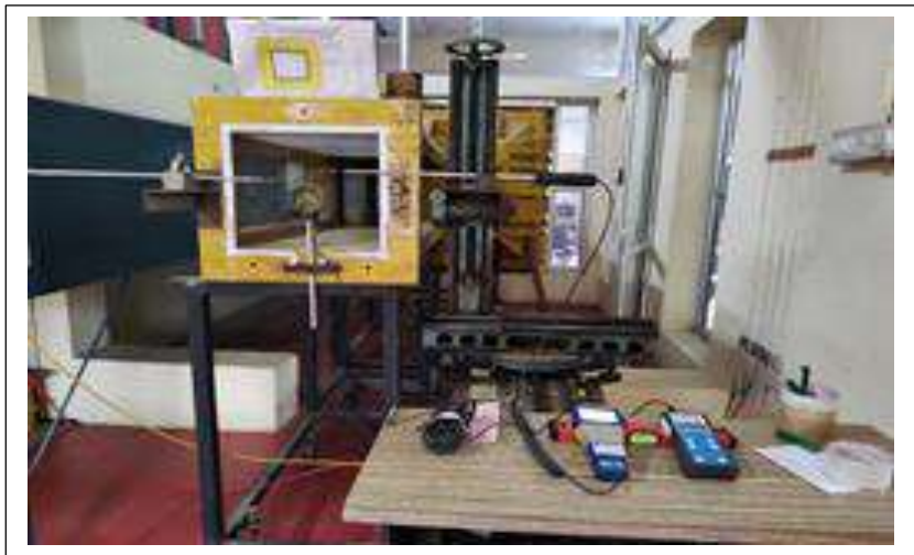
Calibration of Vane Anemometer at Wind Tunnel

Calibration of Vane Anemometer was carried out at Wind Tunnel